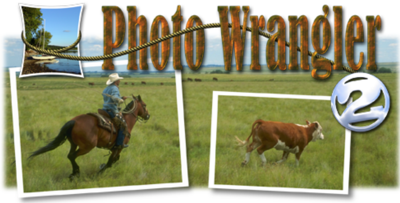
Photo Wrangler 2 User's Guide